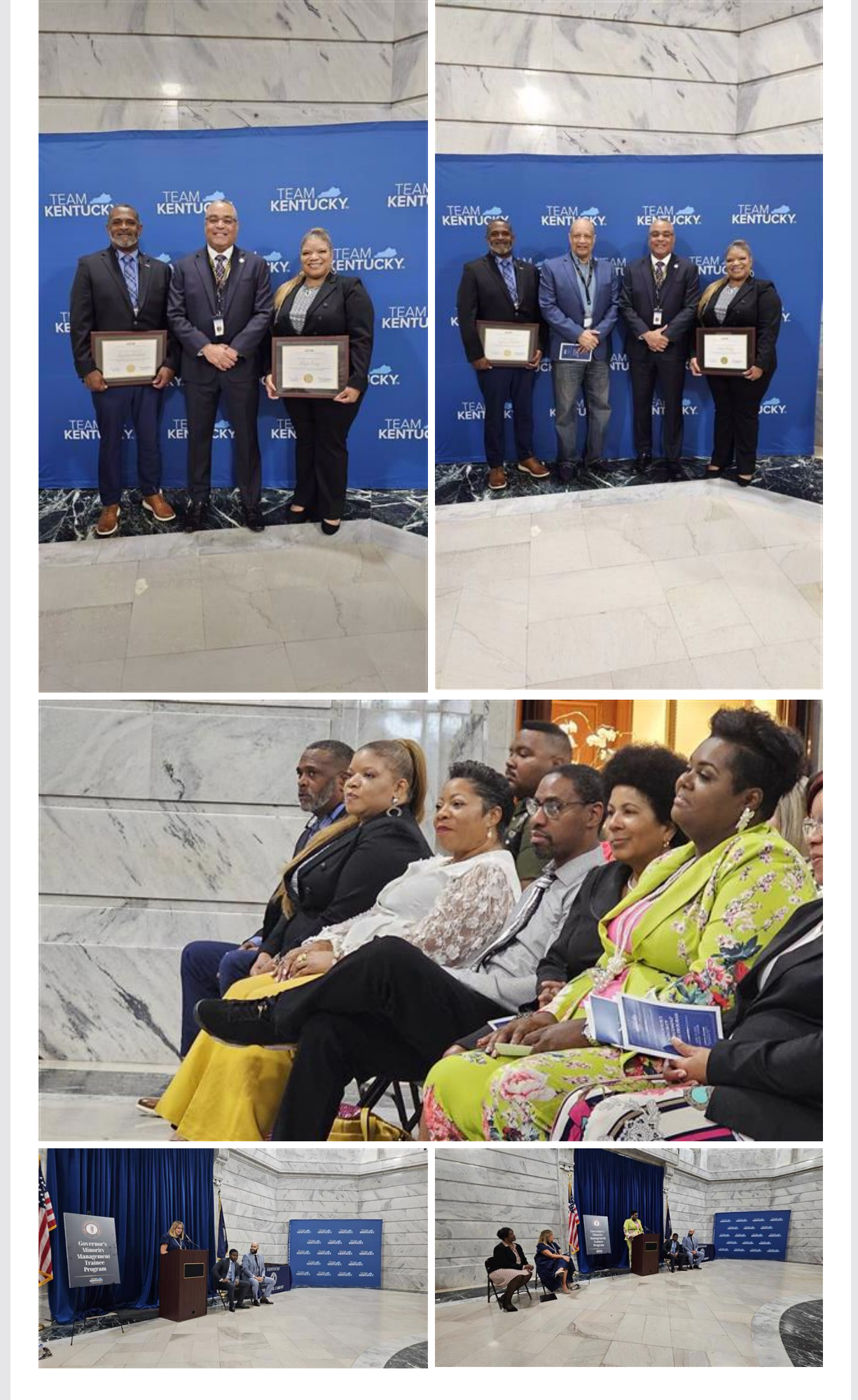
KDVA had two GMMTP candidates graduate from the 2024 Governor's Minority Management Trainee Program which held its Graduation Ceremony in Frankfort, KY, April